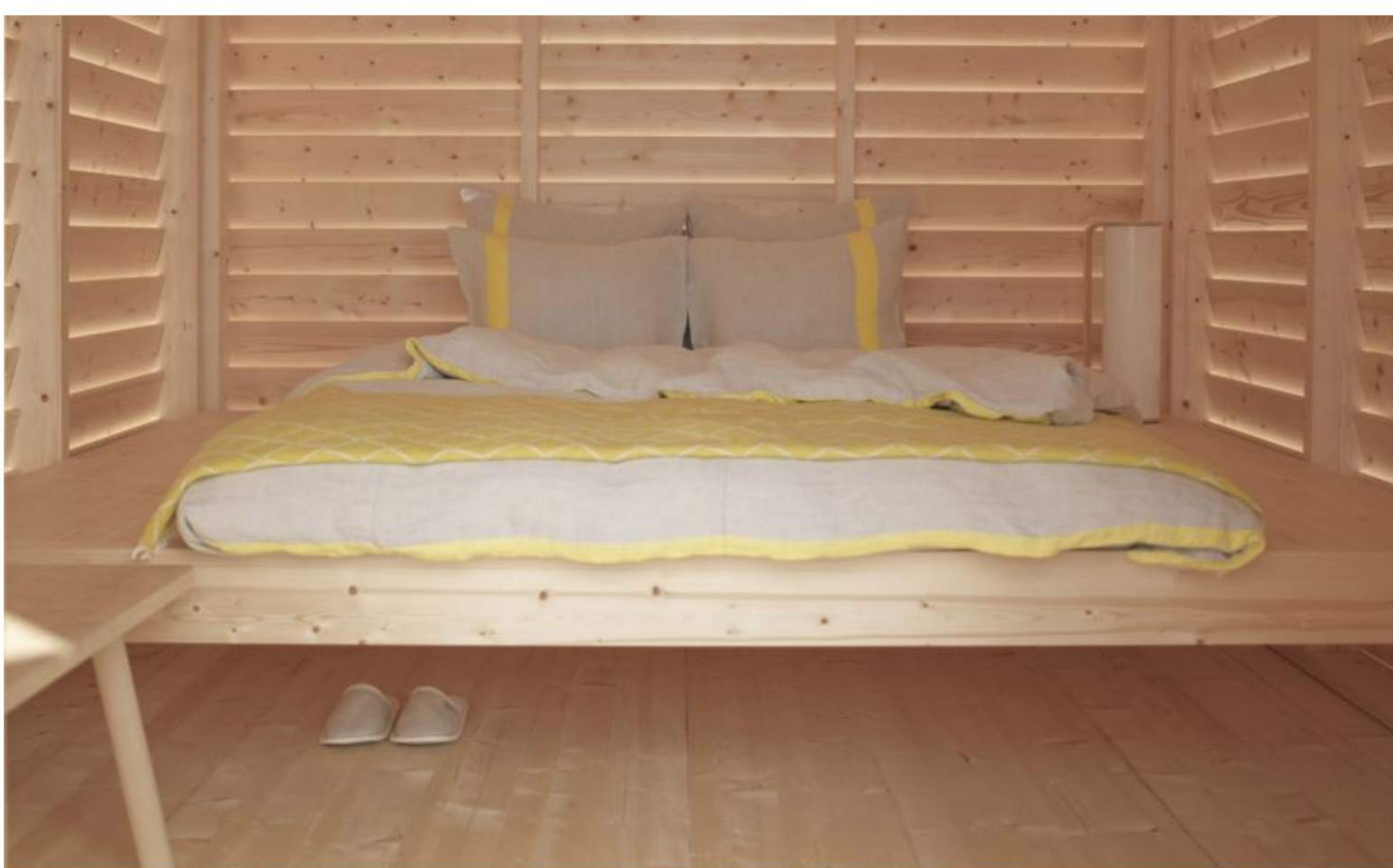
Koti is a bed and breakfast project taking place in the heart of Paris over 100 days in 2017 - an initiative hosted by the Parisian Finnish Institute